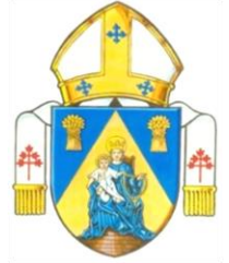
Archdiocese of Regina Coat of Arms